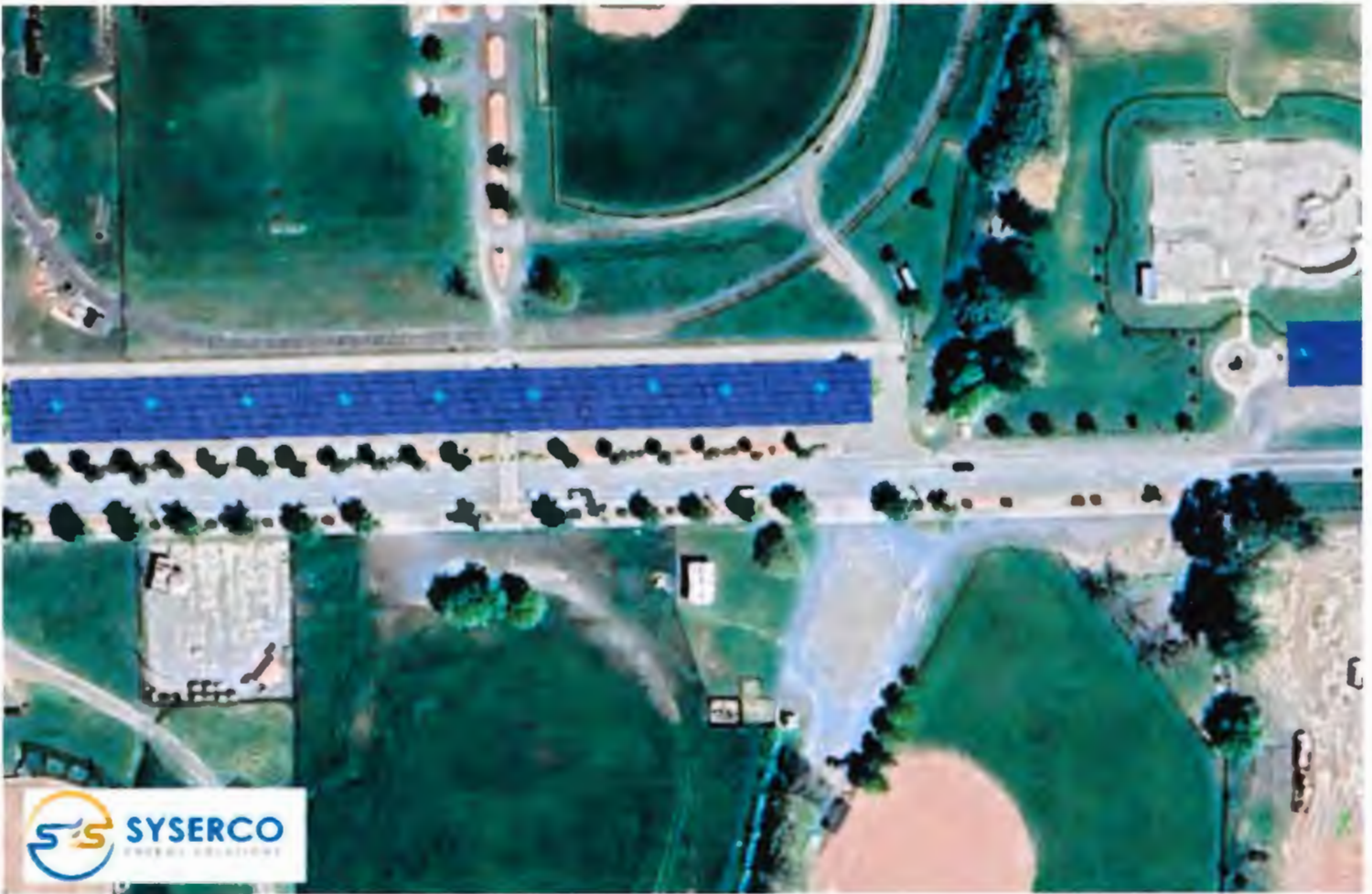
Solar Rooftop panels