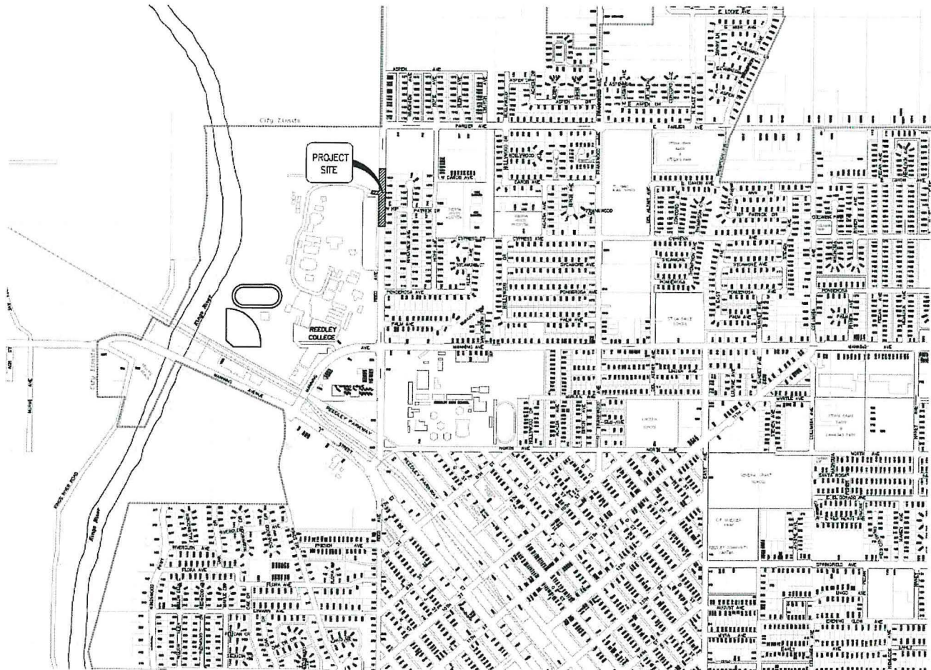
Vicinity Map (not to scale)