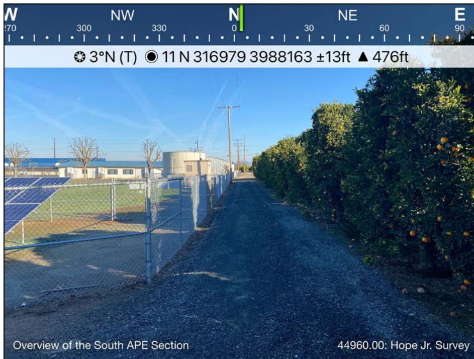
Figure 4. Project study area corridor overview, facing north.