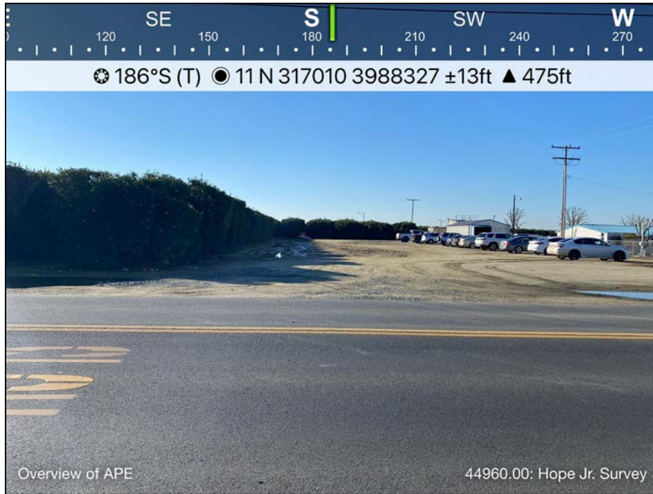
Figure 3. Project study area corridor overview, facing south.