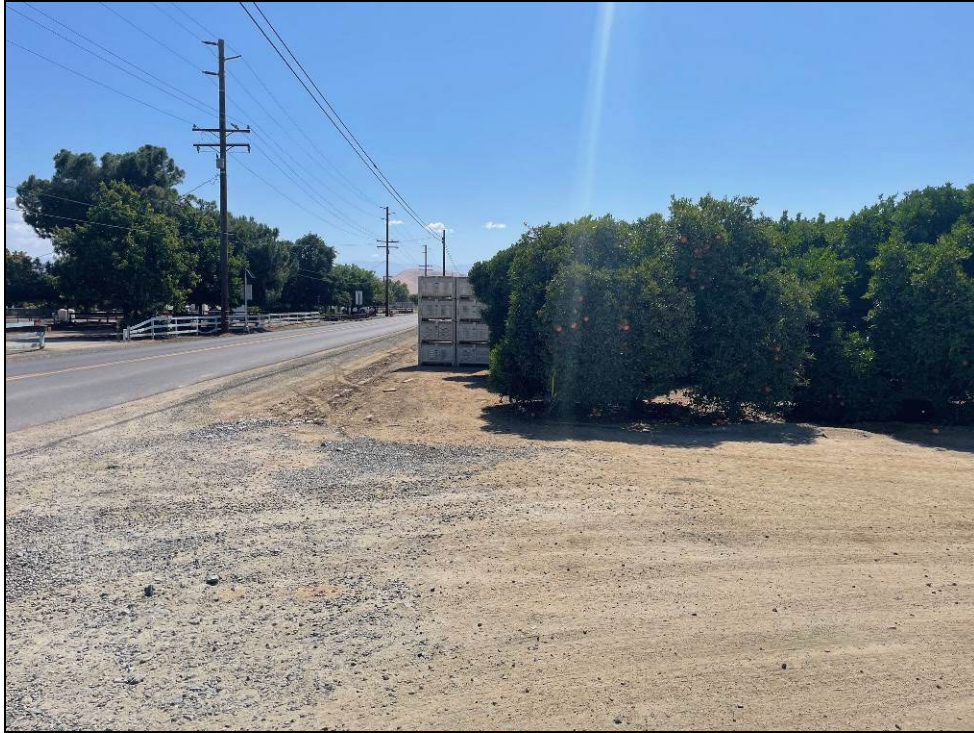
Photo 3. Middle of the Northern Border, Looking East along West Teapot Dome Avenue