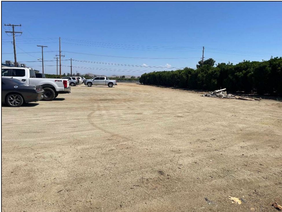
Photo 6. South Side of the Disturbed Area, Looking North Towards West Teapot Dome Avenue