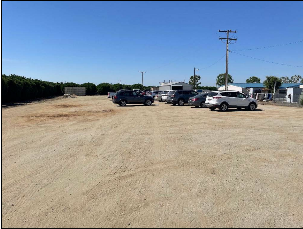
Photo 1. Middle of the Northern Border, Looking South into Disturbed Area of the Project Area