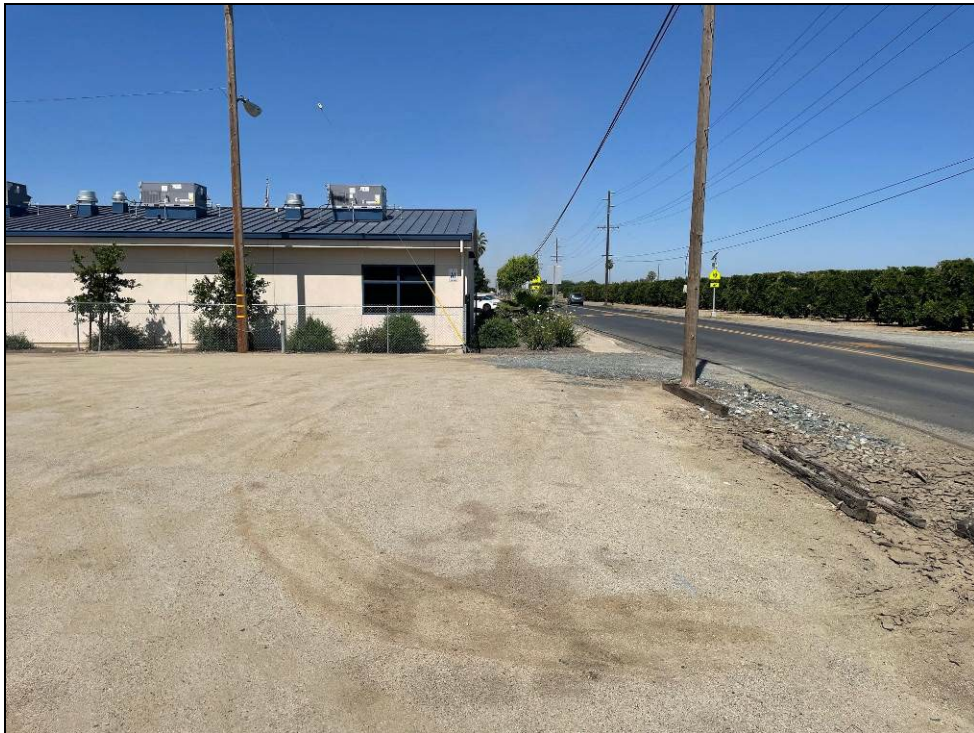
Photo 2. Middle of the Northern Border, Looking West along West Teapot Dome Avenue