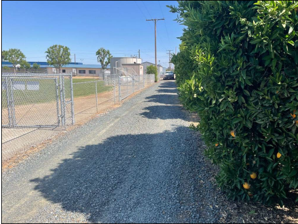
Photo 5. Southwestern Corner of the Project Area, Looking North