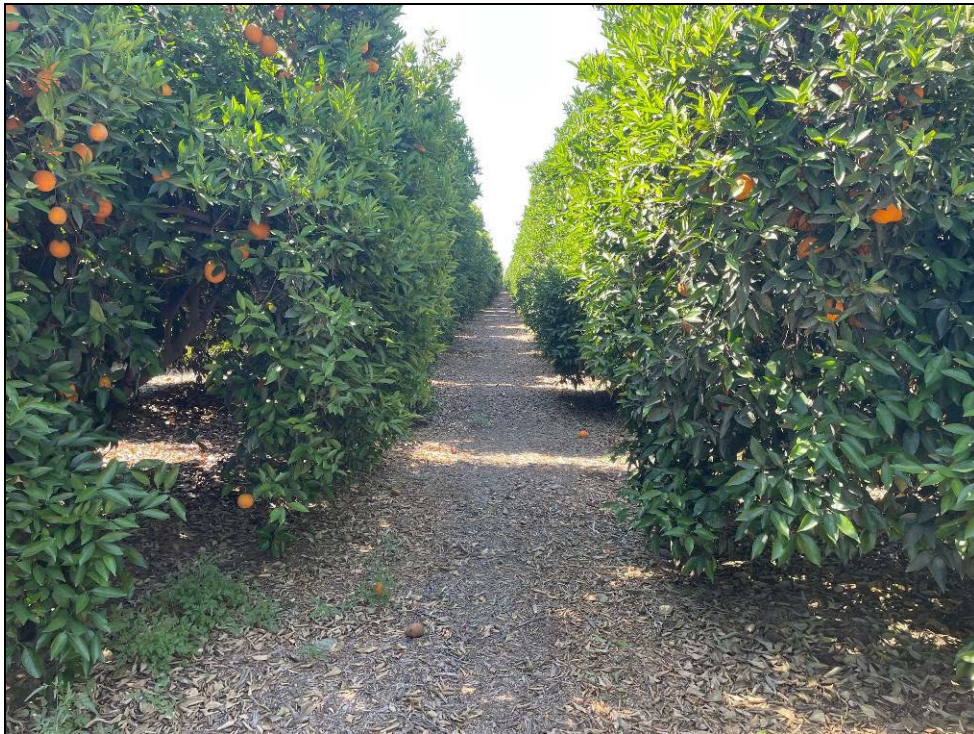
Photo 4. Representative Photo of the Interior of the Active Citrus Orchard