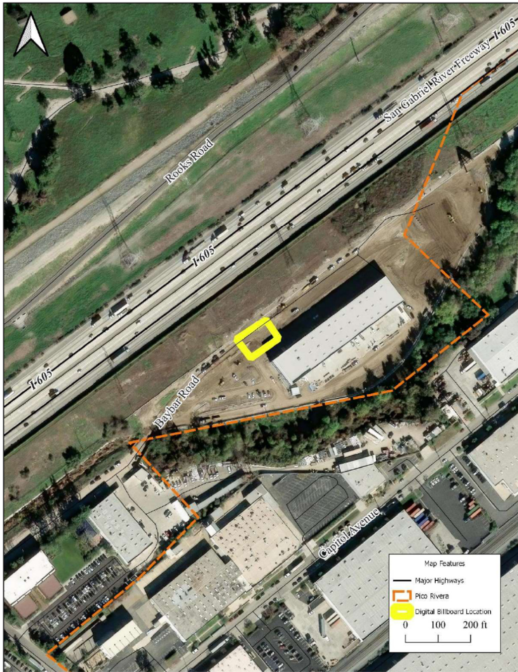
FIGURE 2. BILLBOARD LOCATION MAP