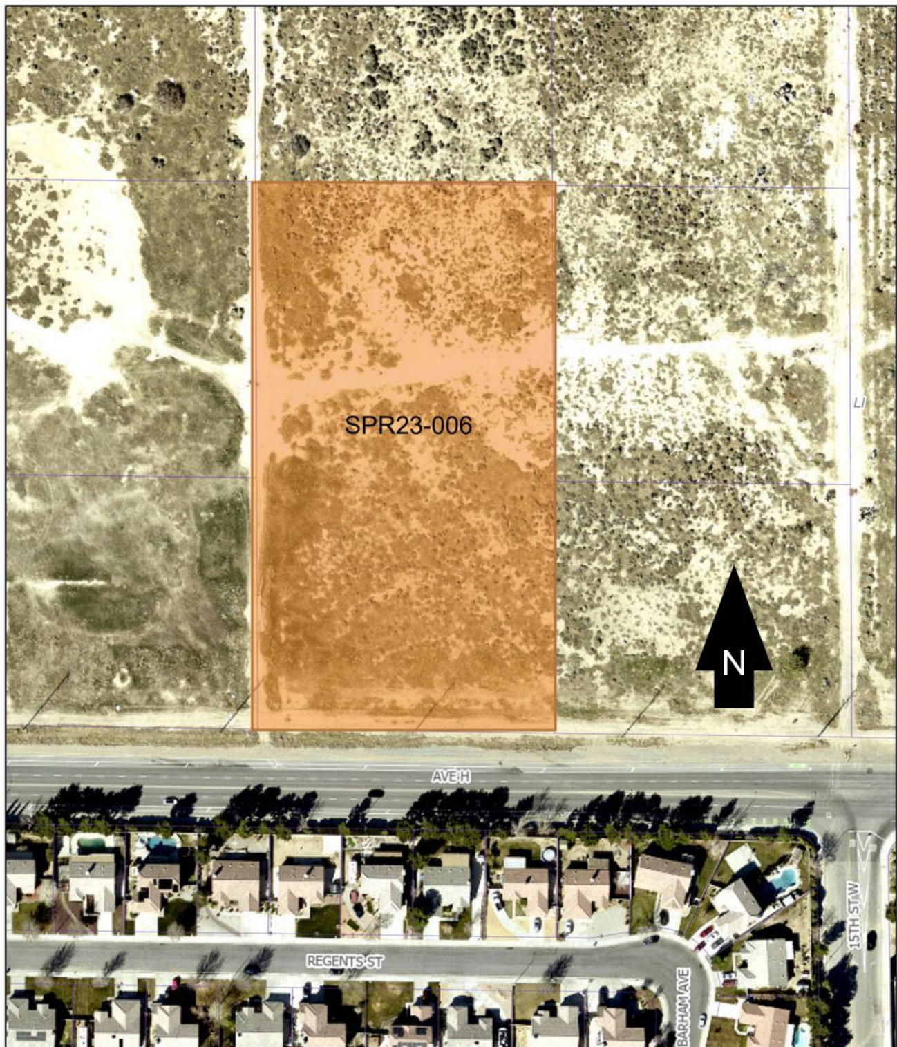
Figure 1, Project Location Map