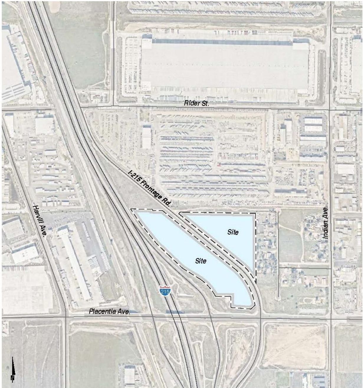
EXHIBIT 1-A: LOCATION MAP