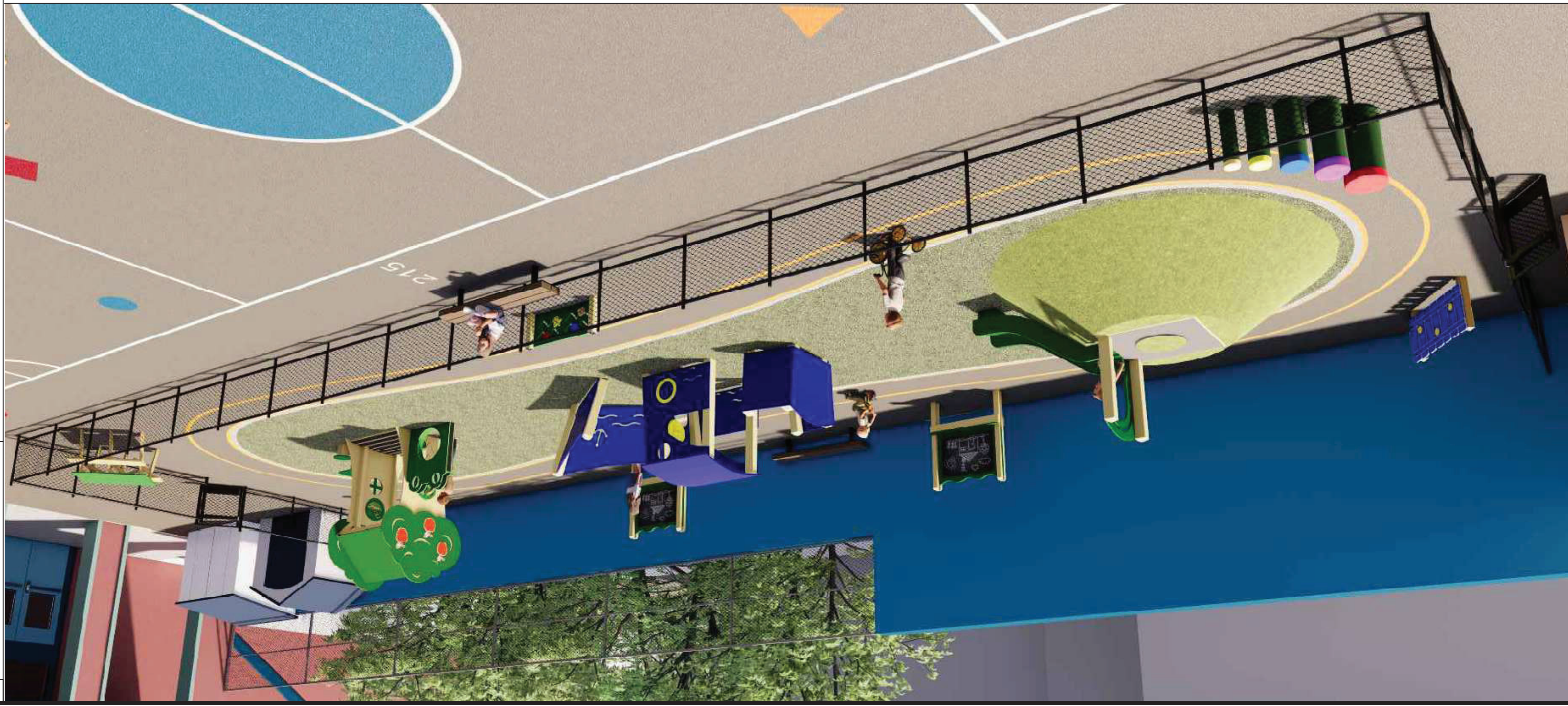
PLAY EQUIPMENT SCHEDULE

NOTE: PLAY EQUIPMENT PRODUCTS ARE NOTED FOR DESIGN INTENT AND REFERENCE ONLY. PRODUCTS WITH EQUIVALENT SPECIFICATIONS MAY BE SUBMITTED FOR REVIEW AND APPROVAL.