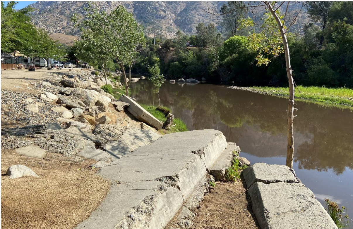
Photograph 4. Broken concrete and imported rocks with landscaped trees for scour protection along the Kern River bank slope, facing northeast. September 13, 2022.