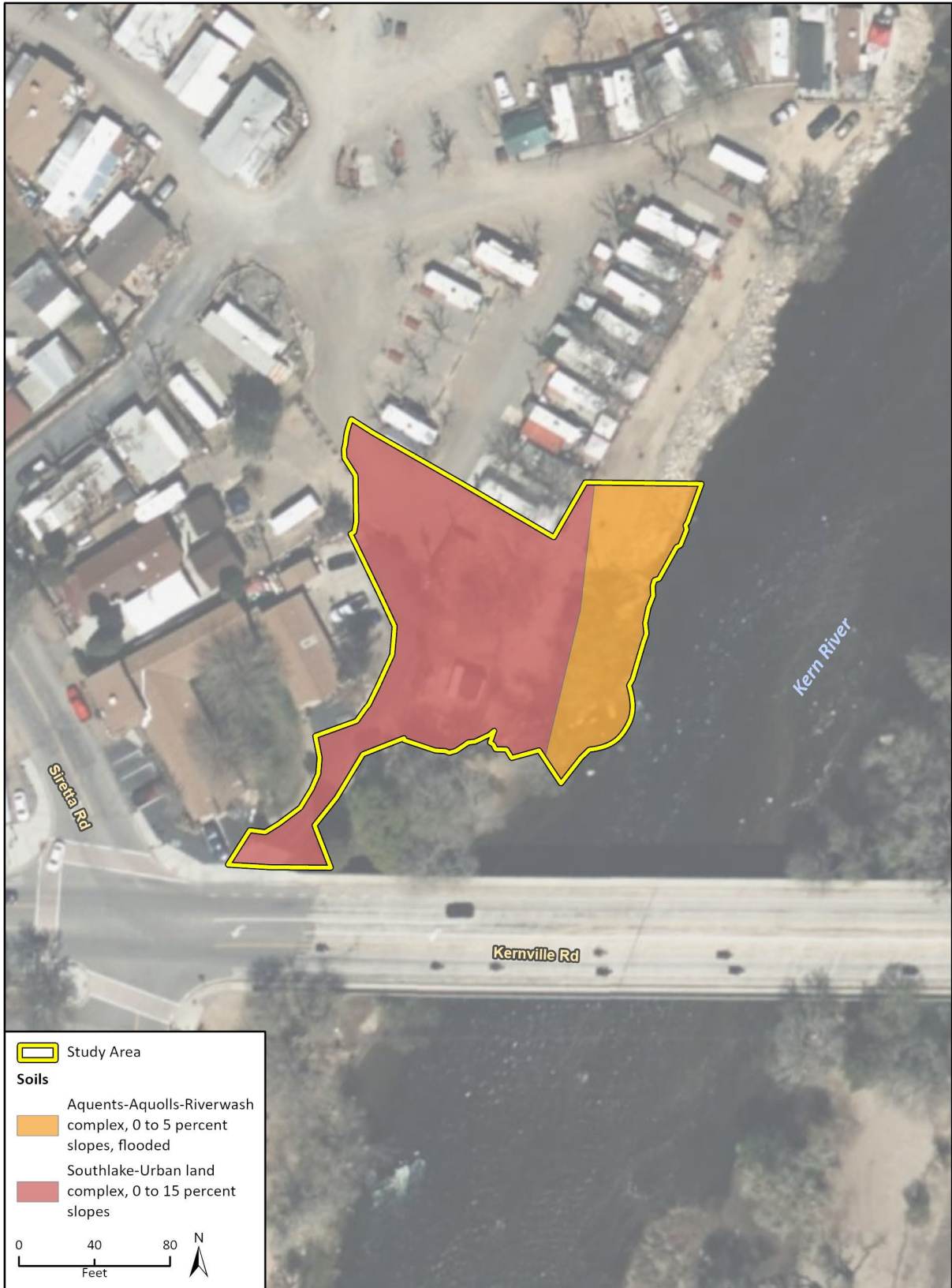
Figure 3 Mapped Soil Units

Additional data provided by Natural Resource Conservation Service Soil Survey Geographic