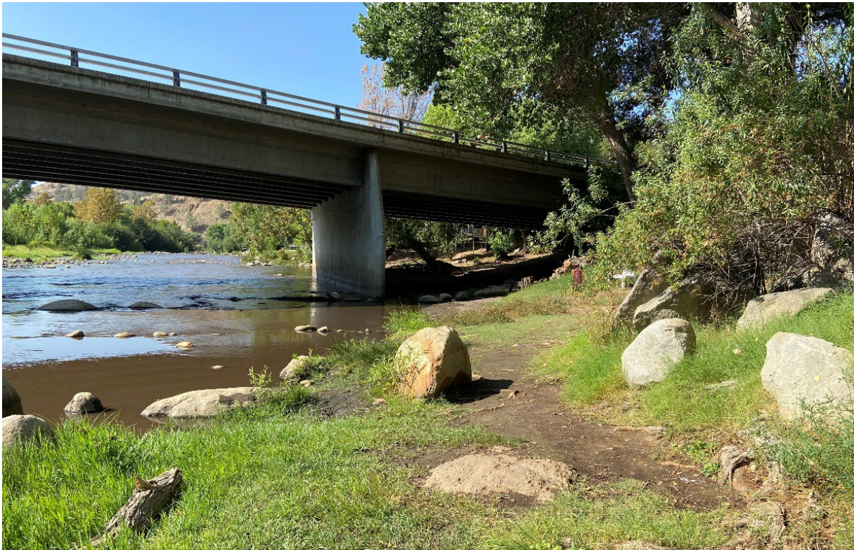
Photograph 2. Kern River and bank south and east of the Study Area, facing south. September 13, 2022.