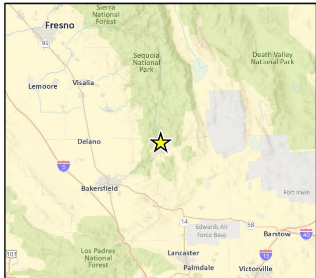
Fig 1. Regional Location