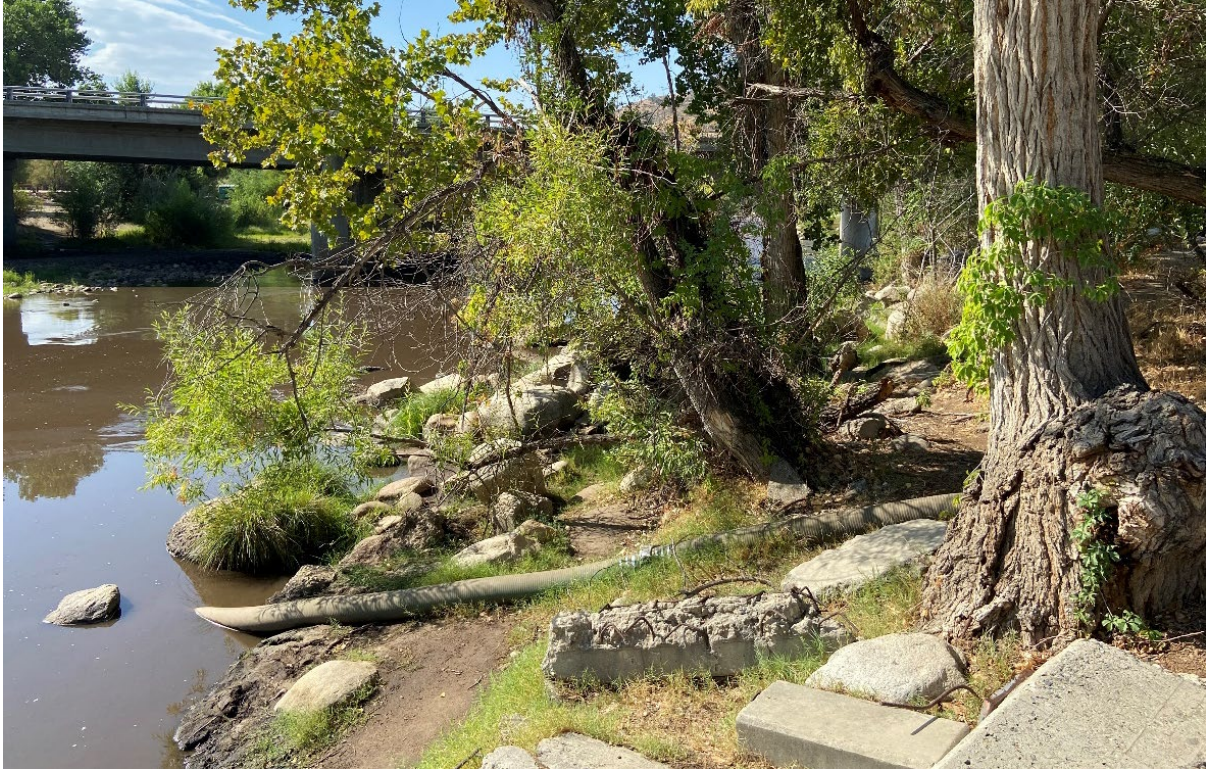
Photograph 3. The existing raw water intake pipe exiting the Kern River and up the bank. Broken concrete and Fremont cottonwood woodland along the bank slope, facing south. September 13, 2022.