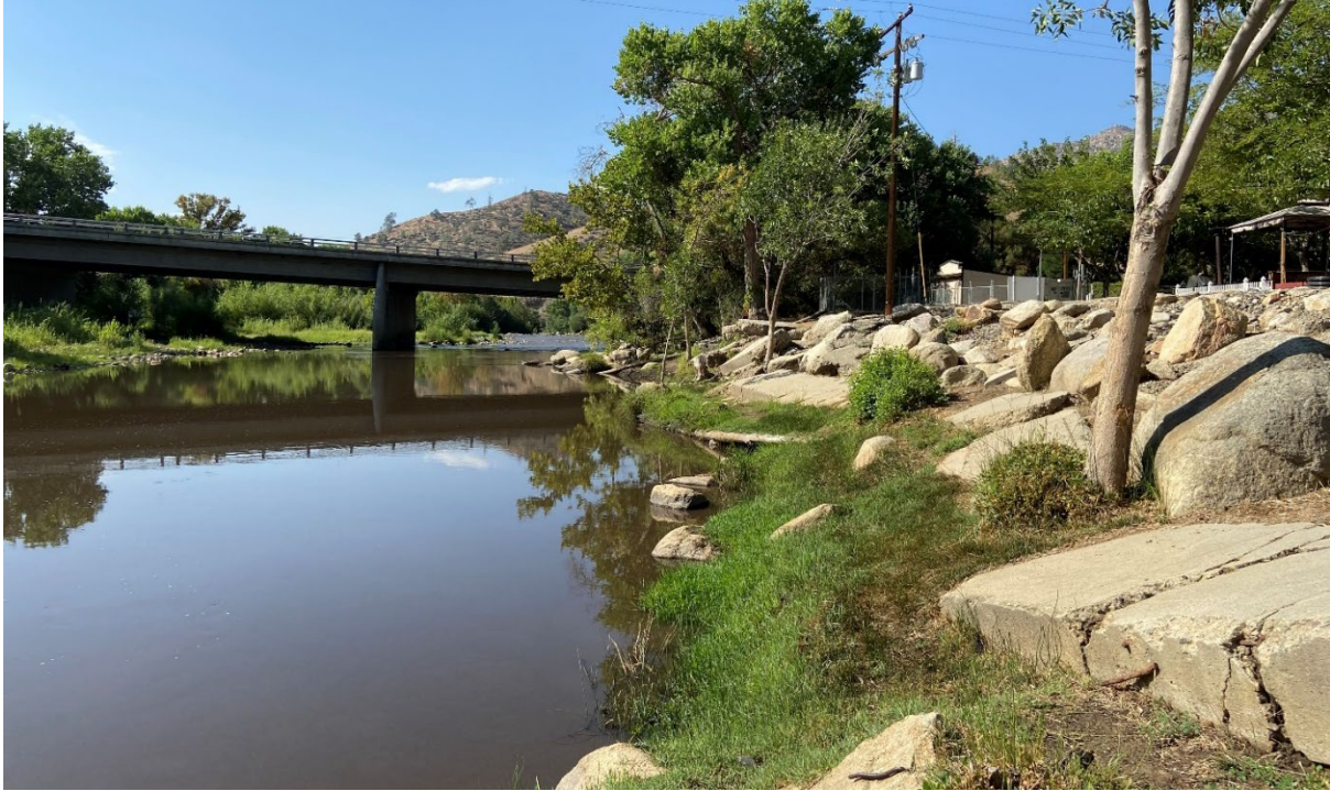
Photograph 1. The Kern River with in-channel vegetation and Bermudagrass turf along the riverbank with broken concrete and imported rock for scour protection, facing south. September 13, 2022.