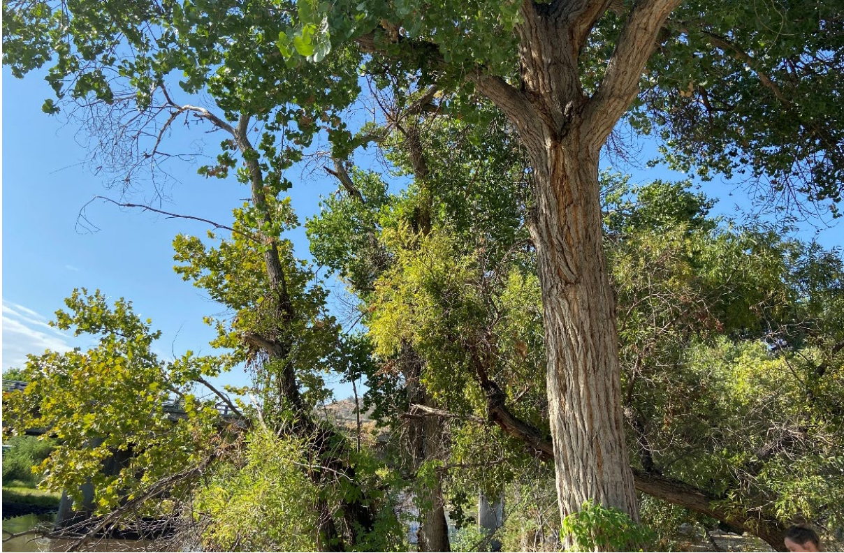
Photograph 5. Fremont cottonwood habitat within the Study Area. September 13, 2022.