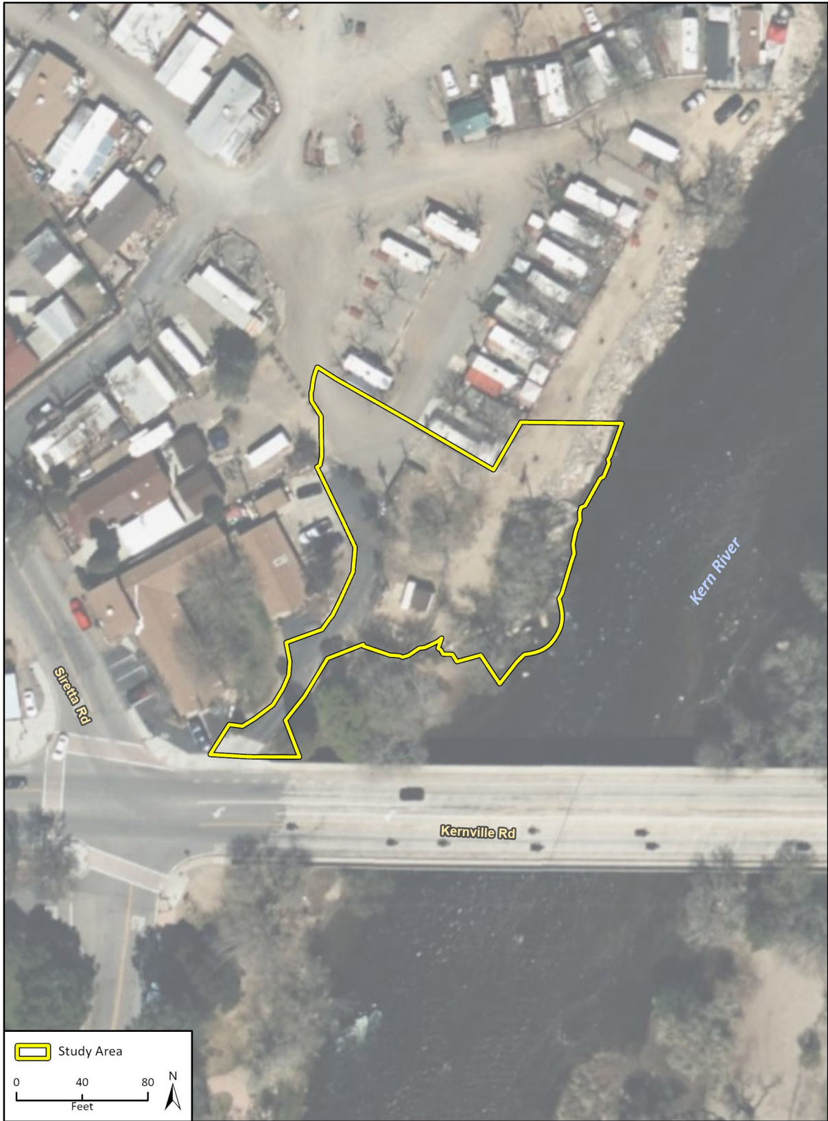
Figure 2 Study Area