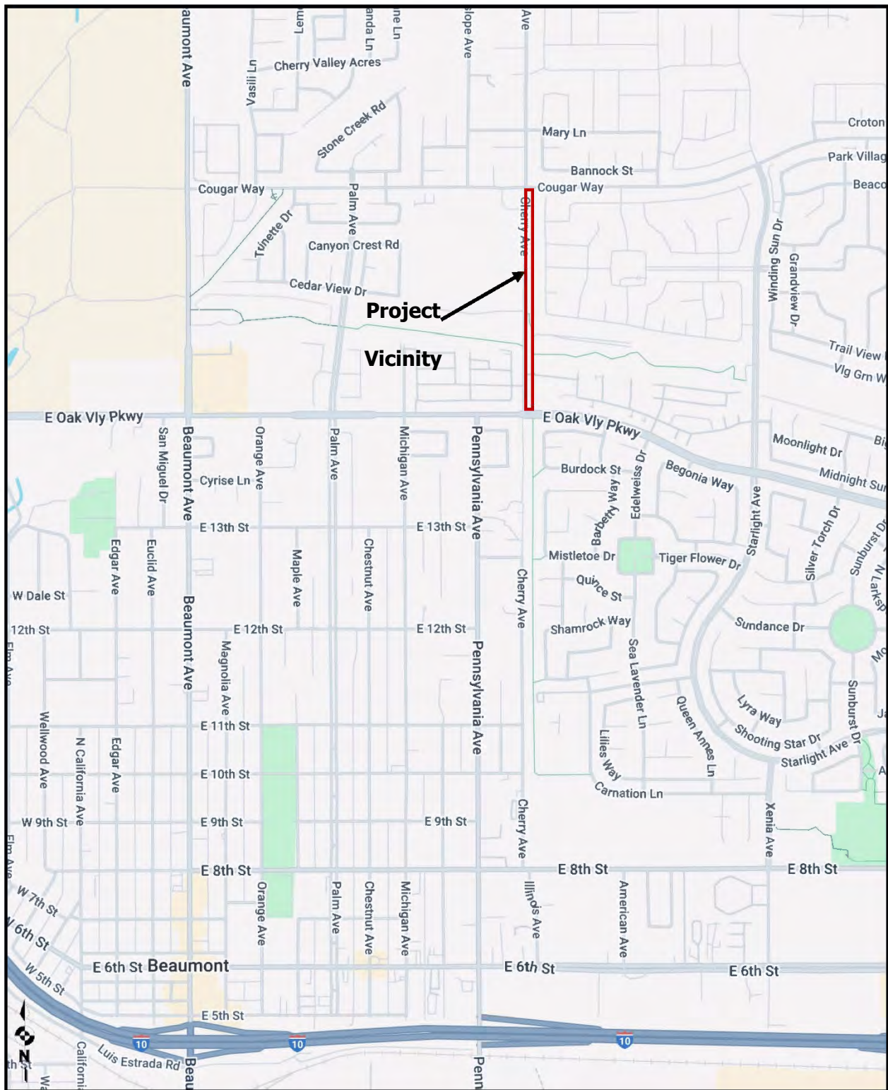
Figure 1: Project Vicinity