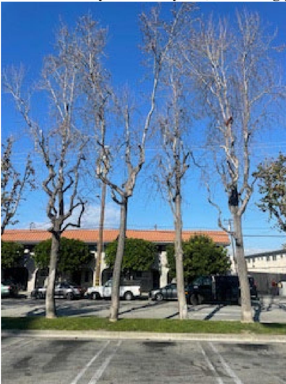
Tree #s 7, 8, 9, and 10, Liquidambar styraciflua , American sweetgum

PO Box 1803, Rancho Cucamonga, Ca. 91729-1803