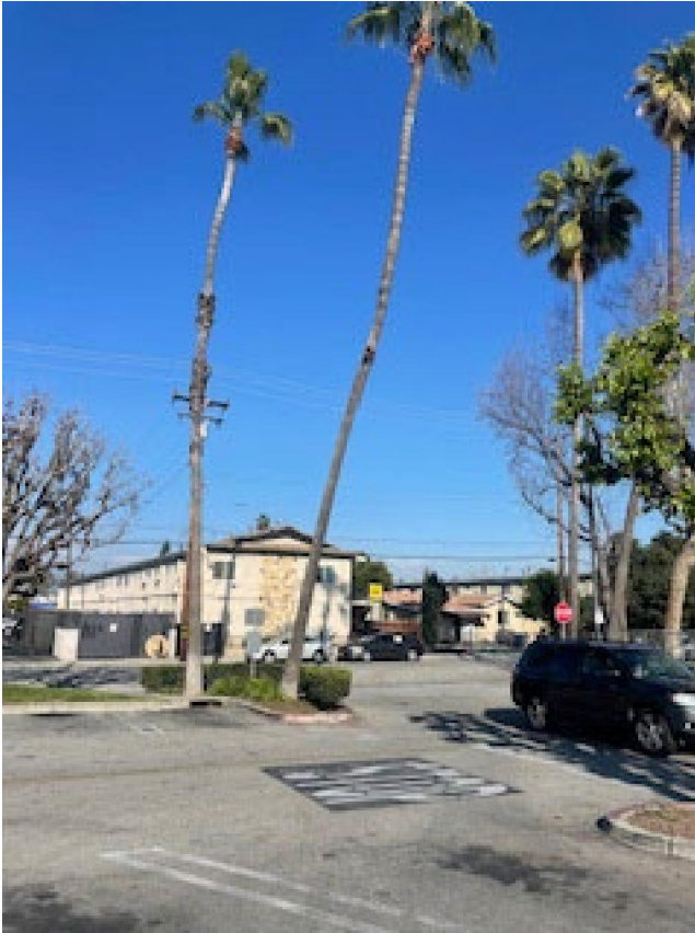
Tree #s 3 & 4, Washingtonia robusta , Mexican fan palms

PO Box 1803, Rancho Cucamonga, Ca. 91729-1803