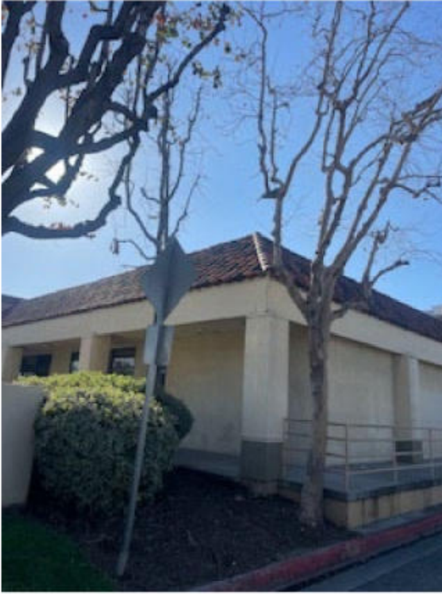
Tree # 13 (left) Platanus acerifolia , London plane tree, #14 (right) Liquidambar styraciflua , American sweet gum

Specimen tree preservation, and analysis