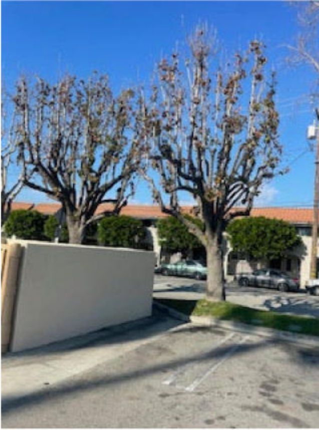
Tree 11 & 12, Tree #5, Pyrus calleryana , flowering pear

Specimen tree preservation, and analysis