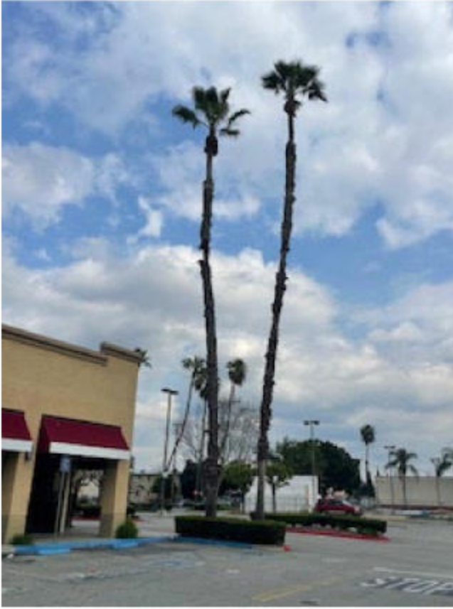
Tree #s 21 & 22, Washingtonia robusta, Mexican fan palm

Specimen tree preservation, and analysis