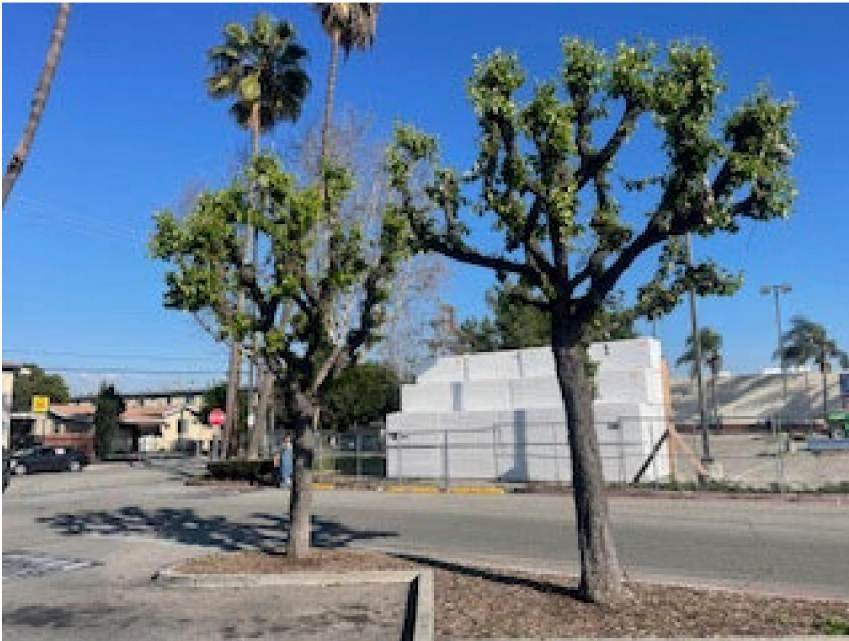
Tree #s 1 & 2, Pyrus kawakami , evergreen pear

Specimen tree preservation, and analysis