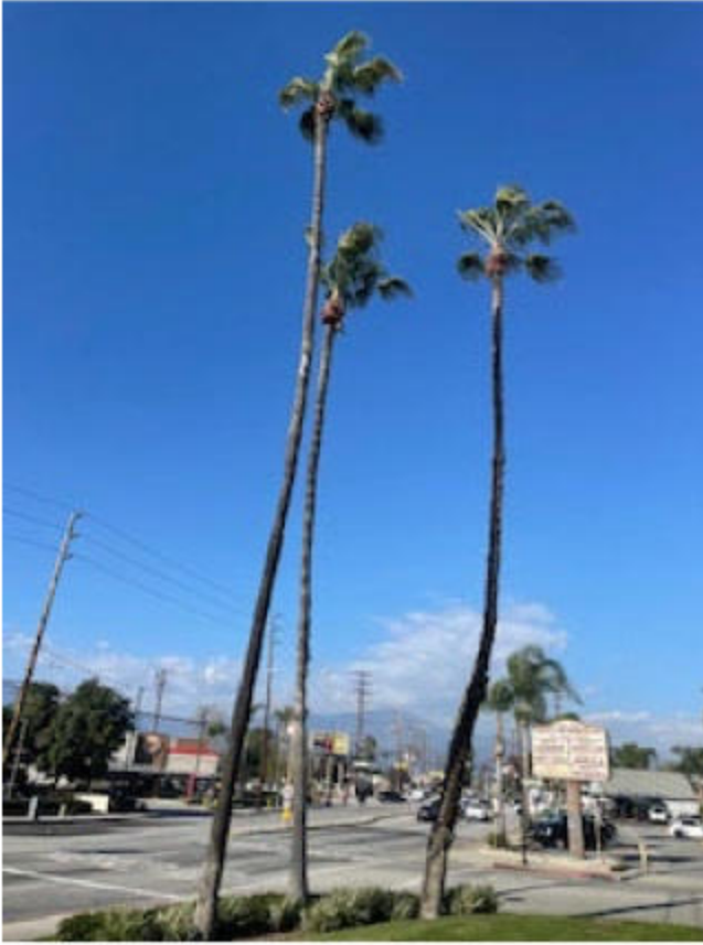
Tree #s 15 and 16, 17 Washingtonia robusta , Mexican fan palm

Specimen tree preservation, and analysis