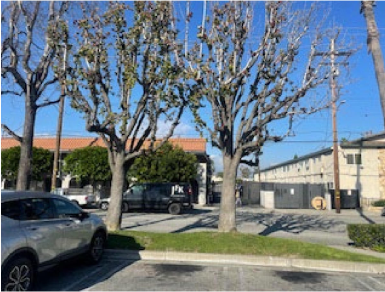
Tree #5 & 6, Pyrus calleryana , flowering pear

Specimen tree preservation, and analysis