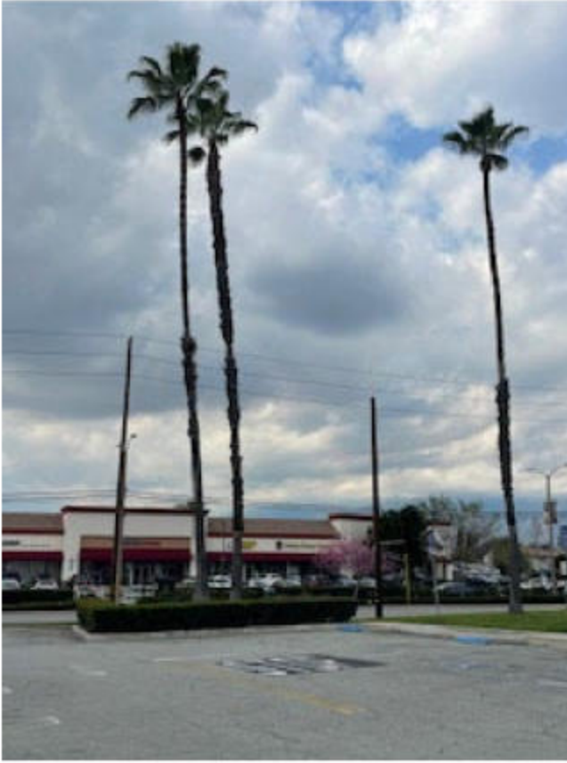
Tree #s 18, 19, and 20 Washingtonia robusta , Mexican fan palm

Specimen tree preservation, and analysis