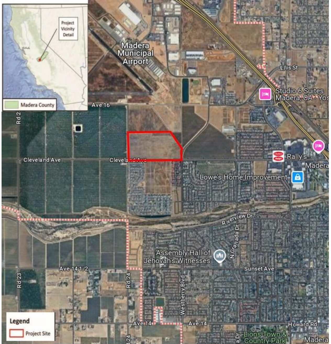
Figure Error! No text of specified style in document.-1 Regional Location