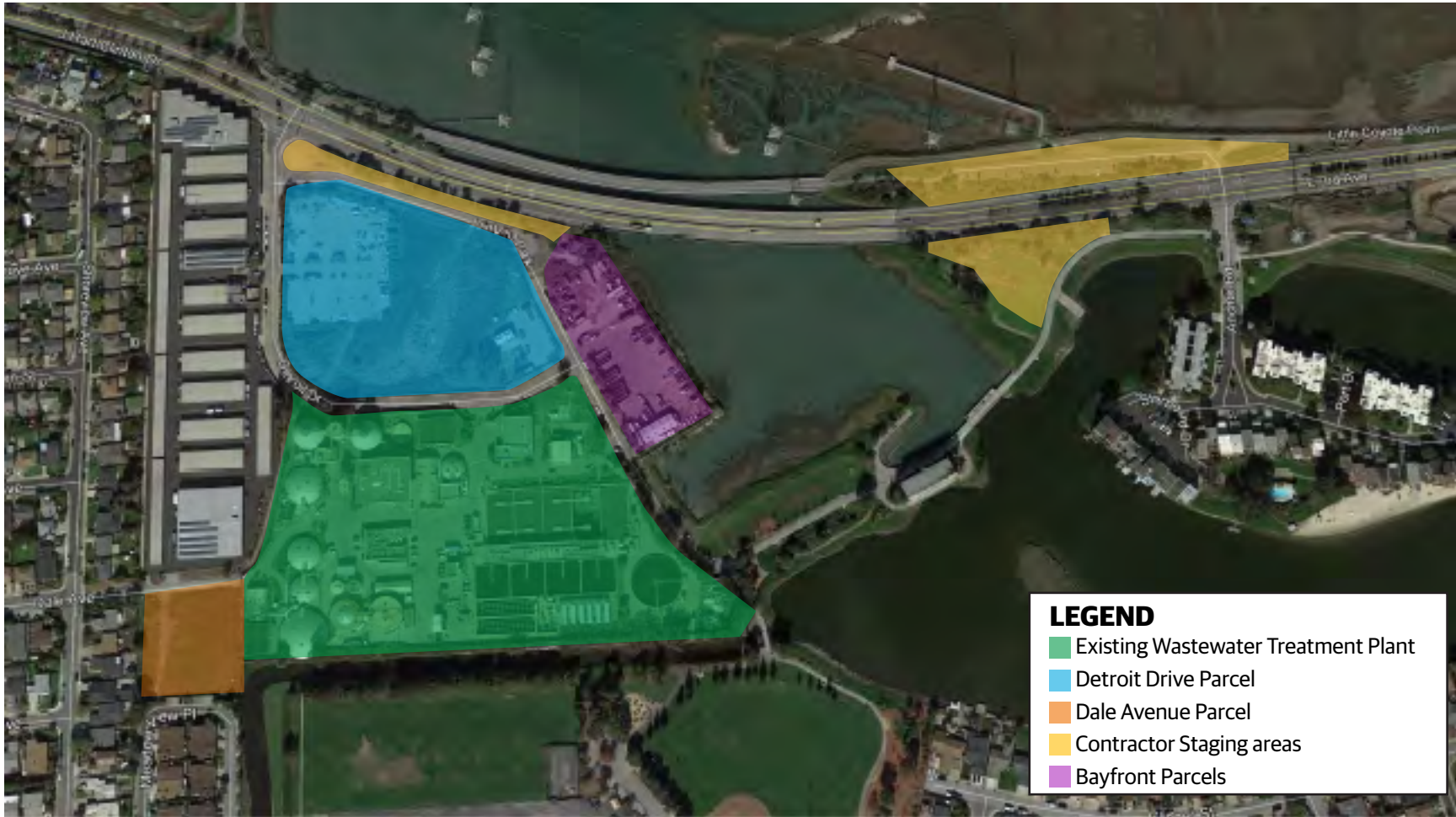
FIGURE 2 Project Parcels Initial Study – Wastewater Treatment Plant Upgrade and Expansion Project City of San Mateo Clean Water Program