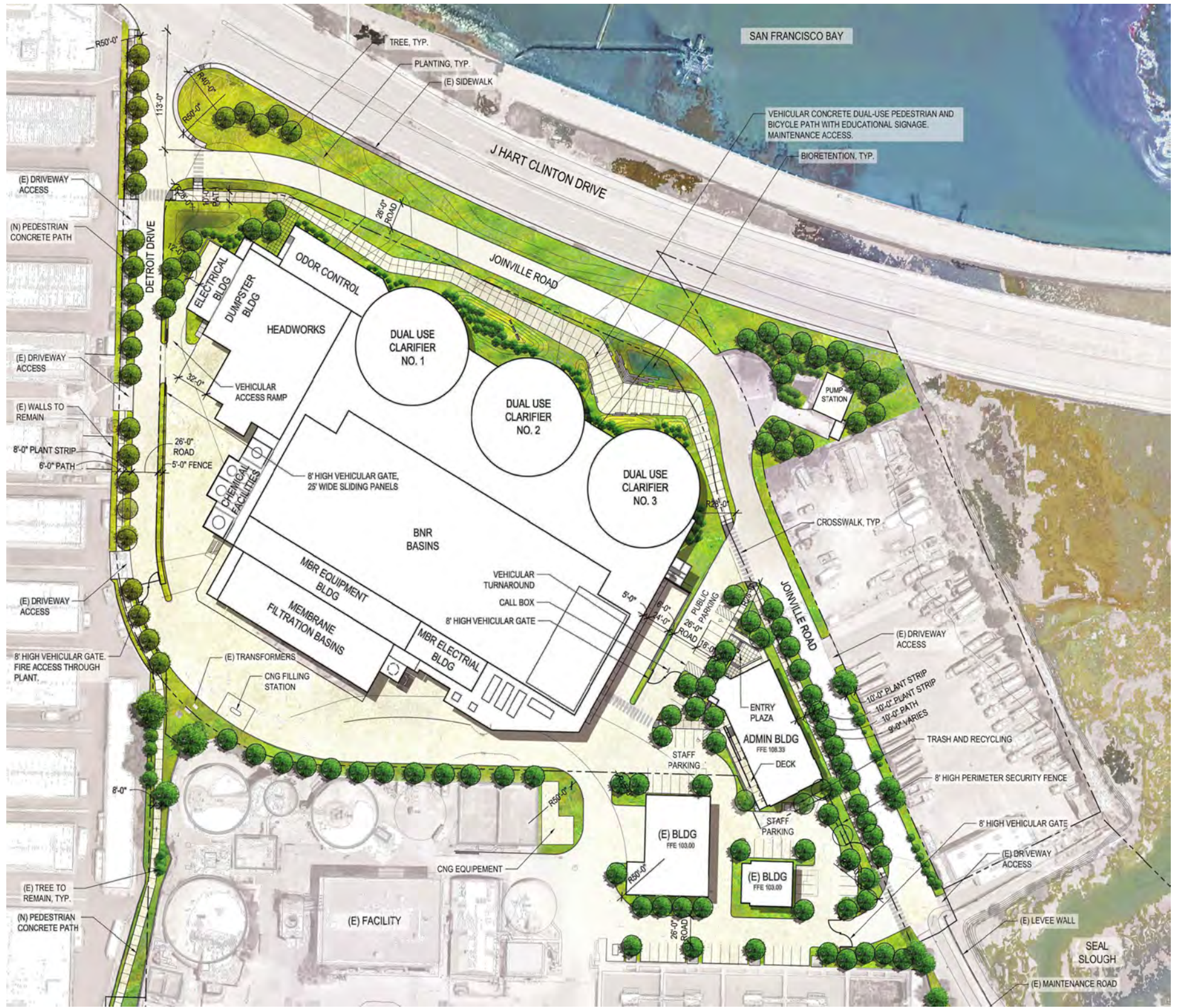
FIGURE 1 Project Layout - Original Project as Addended Initial Study – Wastewater Treatment Plant Upgrade and Expansion Project City of San Mateo Clean Water Program