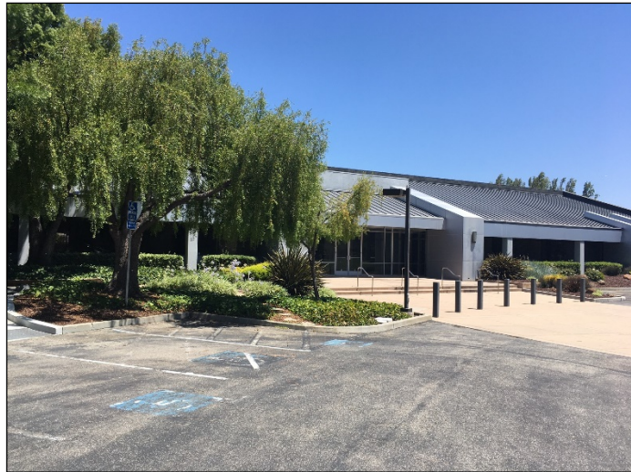
Photo 1. Developed/Landscaped Land Cover Type on the Project Site

The reconnaissance-level survey identified one general habitat type on the site: developed/landscaped. The site consists of asphalt pavement and existing commercial buildings with associated landscaping (Photos 1 and 2). A complete list of trees on the project site is provided in the arborist report for the project (Appendix A). Non-native tree species on the site include Canary Island pine ( Pinus canariensis ), sweetgum ( Liquidambar styraciflua ), silver dollar eucalyptus ( Eucalyptus polyanthemos ), red alder ( Alnus rubra ), African fern pine ( Afrocarpus falcatus ), holly oak ( Quercus ilex ) and fragrant olive ( Osmanthus fragrans ). The only locally native tree on the site is one coast live oak ( Quercus agrifolia ). Landscaped areas also contained a variety of non-native plants and shrubs, such as oleander ( Nerium oleander ), as well as ground cover, such as grass lawns, cape weed ( Arctotheca calendula ), and English ivy ( Hedera helix ).