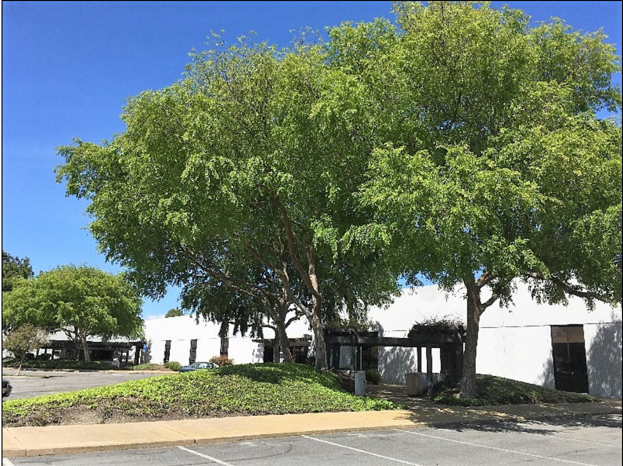
Photo 3. Tress 1048-1051 (left to right), all are Chinese elm ( Ulmus parvifolia ).