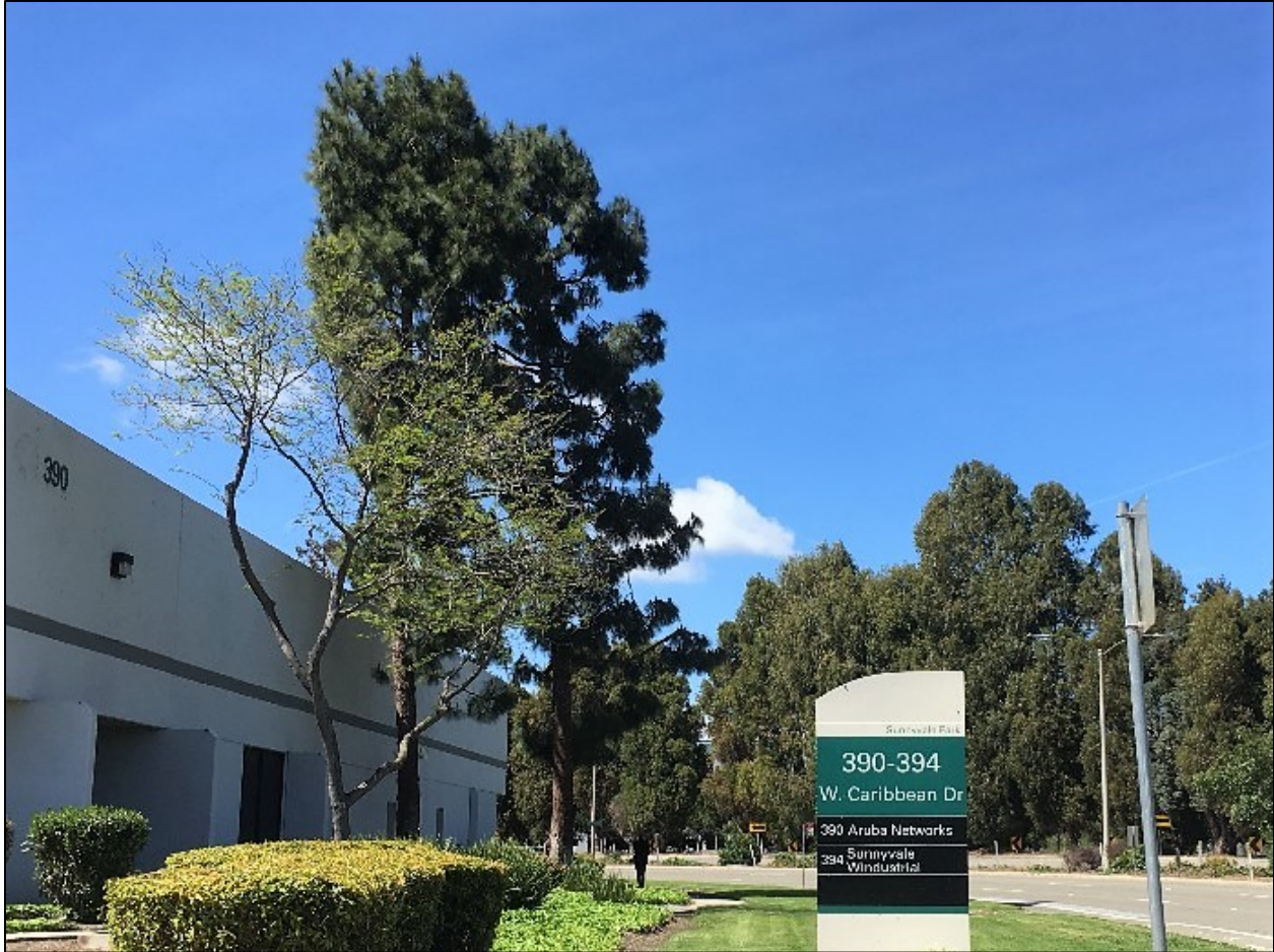
Photo 5. Tree 2144 (foreground), jacaranda ( Jacaranda mimosifolia ) and Trees 2142-2143 (background), Canary Island pine ( Pinus canariensis ).