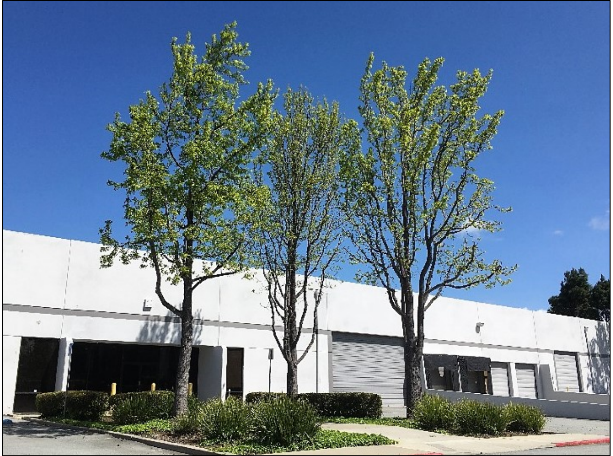
Photo 4. Trees 2124-2126 (left to right), all are sweetgum ( Liquidambar styraciflua ).