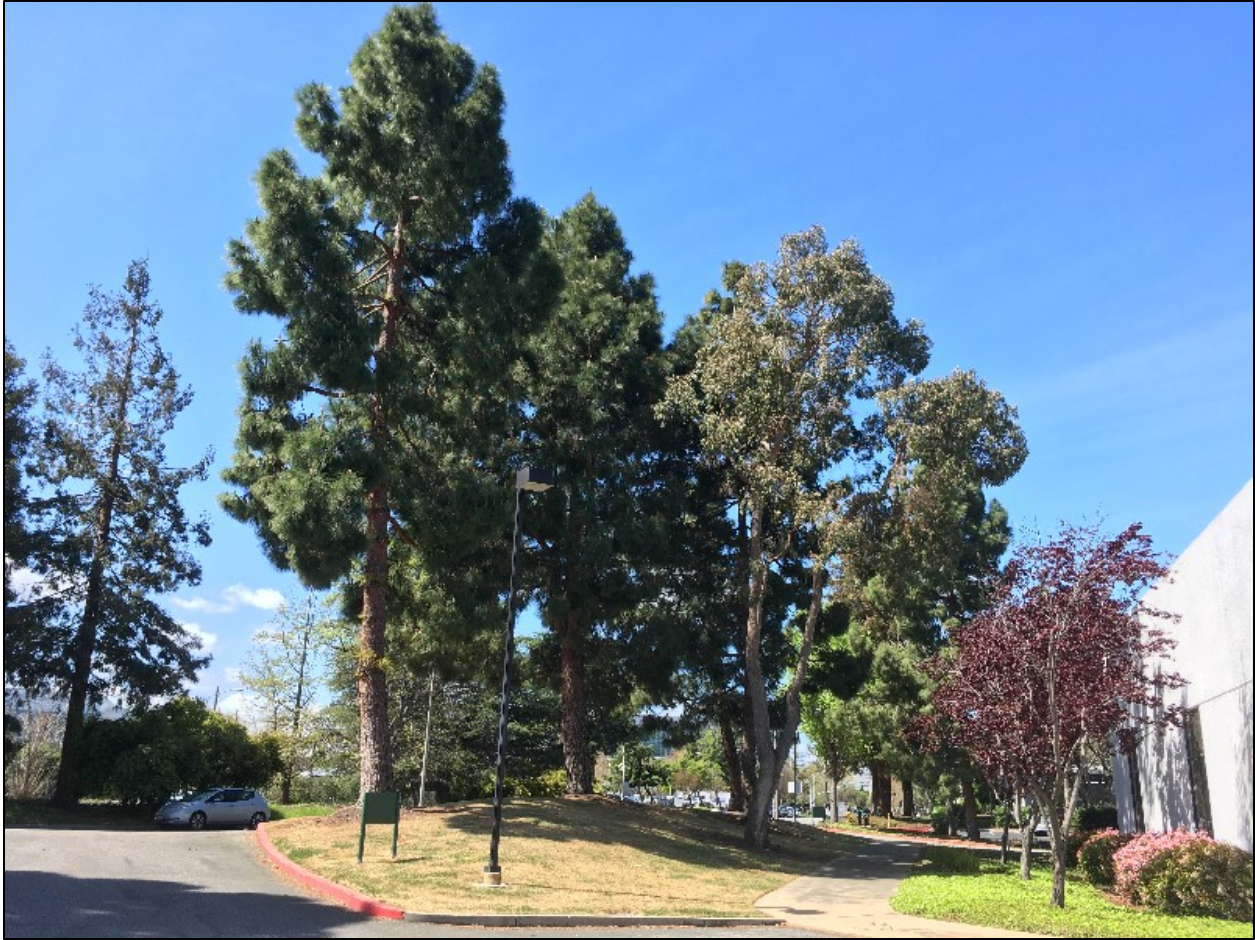
Photo 2. Tree 1006 (left side), Canary Island pine ( Pinus canariensis ). Tree #1011 (right side), purple leaf plum ( Prunus cerasifera ).