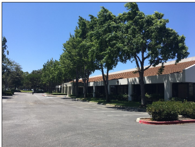
Photo 2. Typical Non-Native Trees on the Site

Wildlife species associated with the project site include species accustomed to urban environments and high levels of human disturbance. Native bird species observed during the July 2017 site visit include the black phoebe ( Sayornis nigricans ), lesser goldfinch ( Spinus psaltria ), dark-eyed junco ( Junco hyemalis ), house finch ( Haemorhous mexicanus ), Anna's hummingbird ( Calypte anna ), Bullock's oriole ( Icterus bullockii ), bushtit ( Psaltriparus minimus ), chestnut-backed chickadee ( Poecile rufescens ), Bewick's wren ( Thryomanes bewickii ), Nuttall's woodpecker ( Picoides nuttallii ), mourning dove ( Zenaidura macroura ), and American crow ( Corvus brachyrhynchos ). Each of these species may use the trees, shrubs, or ground vegetation on the site for nesting. Mammal species expected to use the site include the nonnative black rat ( Rattus rattus ) and Virginia opossum