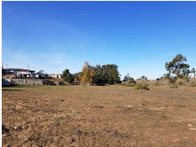
LOOKING TOWARDS CALIFORNIA BLVD FROM WHERE OPTIONS A & B ENTER THE OASIS SITE