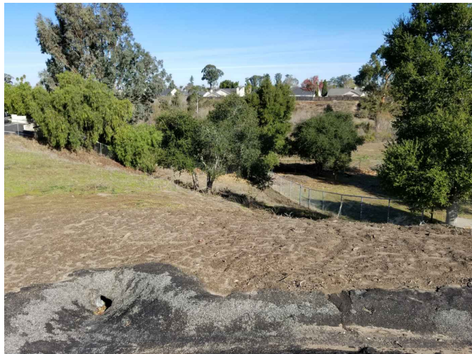
LOOKING DOWN THE DRIVEWAY AT PARK AVE