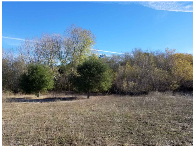
LOOKING TOWARDS THE DRIVEWAY LOCATION IN ORCUTT CREEK FROM THE OASIS SITE