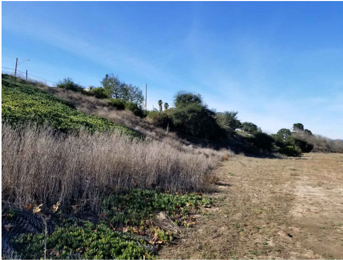
LOOKING FROM OASIS SITE UP THE DRIVEWAY TO CLARK AVE & NORRIS AVE