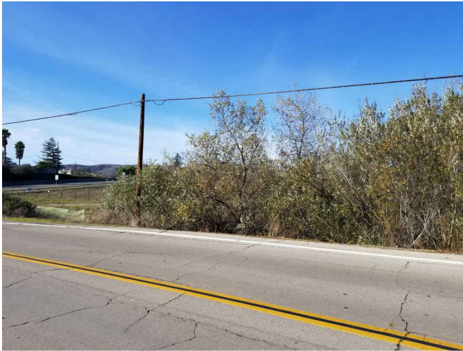
LOOKING AT THE DRIVEWAY ENTRANCE ON FOXENWOOD LANE