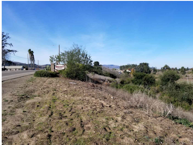
DRIVEWAY OFF CLARK AVE AT NORRIS AVE