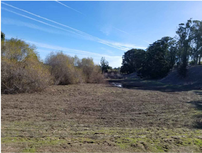
LOOKING DOWN THE DRIVEWAY ENTRANCE AT CALIFORNIA BLVD INTO THE DETENTION BASIN