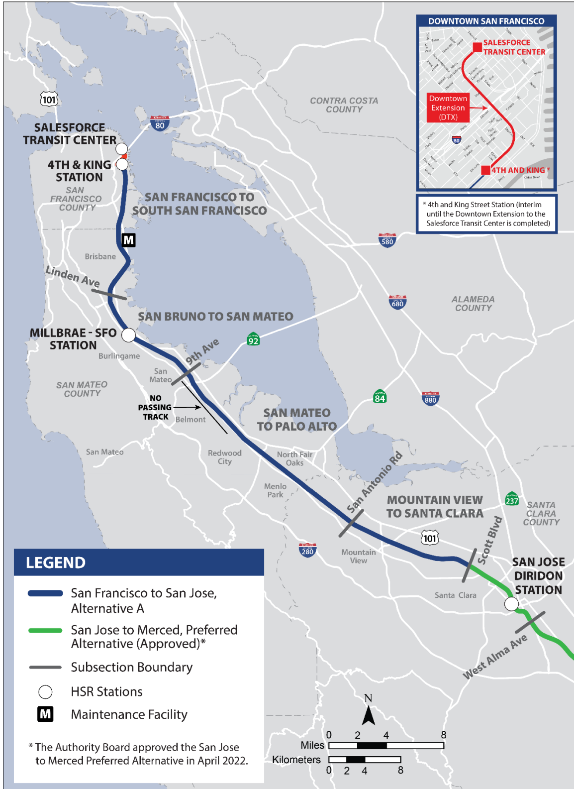
Map of Approved Preferred Alternative