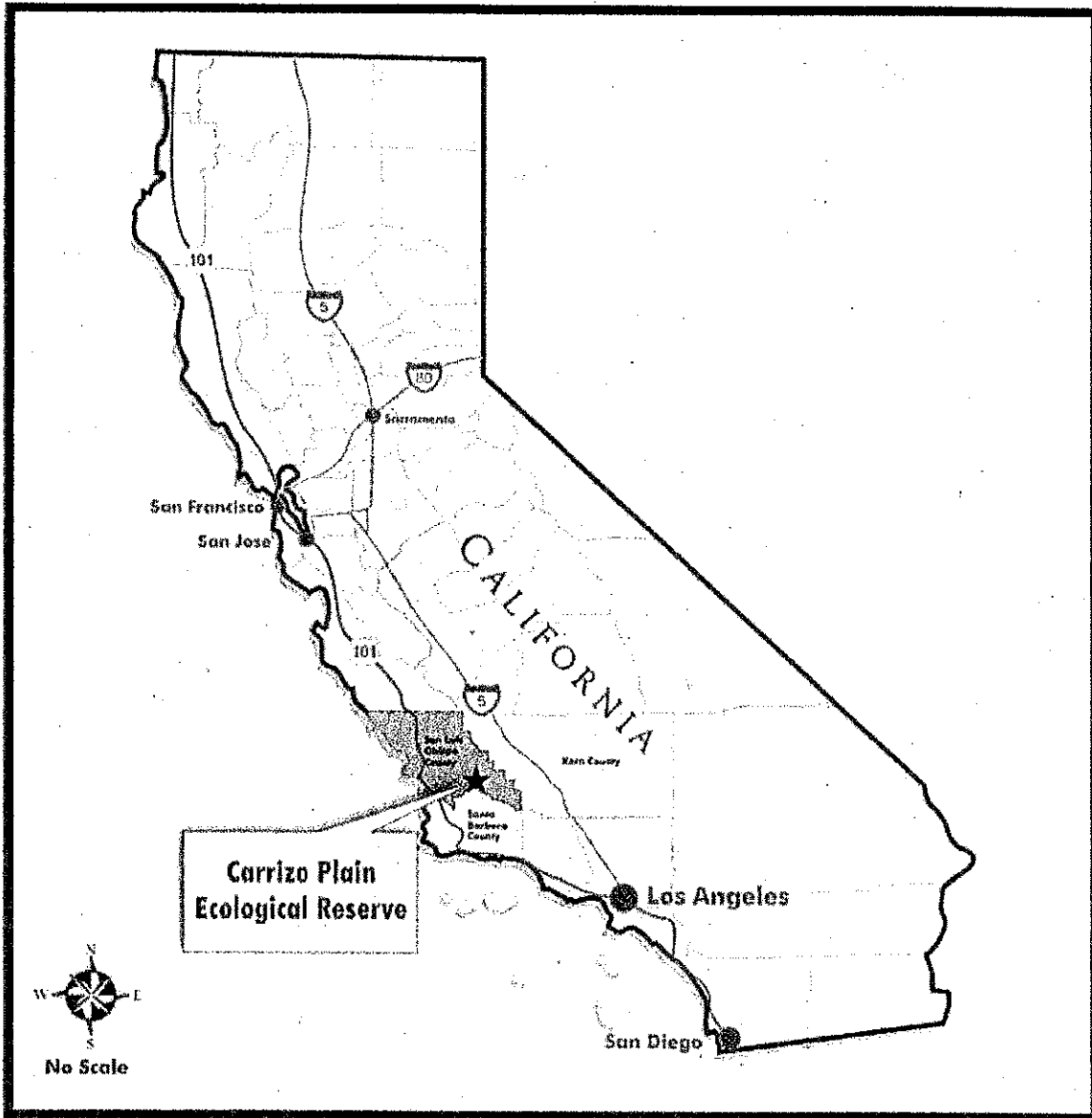
Figure 1 – State Location